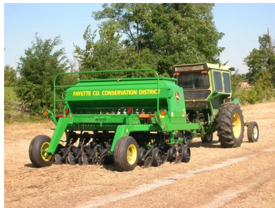
A no-till drill in use on a farm in Fayette County.