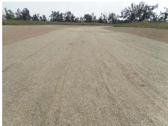
Grassed Waterway in Livingston County

Another component of the cost share program is the environmental grant program for conservation districts. Conservation districts can apply for an environmental grant to address a special need in their county. Many districts assist their local fiscal courts with fallen animal removal through the environmental grant program. During fiscal year 2011, 55 dead animal removal grants were awarded for a grand total of $275,000.00. Other grants are used for white goods clean-up, scrap metal collection, illegal dump clean-ups, and local cost share programs.