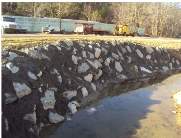
Protection completed on eroded stream bank in Carter County under EWP

Division of Conservation, local conservation districts, USDA-NRCS and local sponsors such as Fiscal Courts, City Councils etc. all worked together to mend a lot of damage that occurred from weather events that created havoc across Kentucky of late. Many counties across Kentucky received disaster declarations from recent storm events, and with that they gained eligibility for funding assistance through the federal Emergency Watershed Protection Program (EWPP). These events certainly brought more damage and destruction than many counties and city municipalities could deal with on their own without creating an economic hardship of immense proportion.