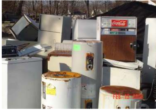
White Goods Clean-up in Carlisle County