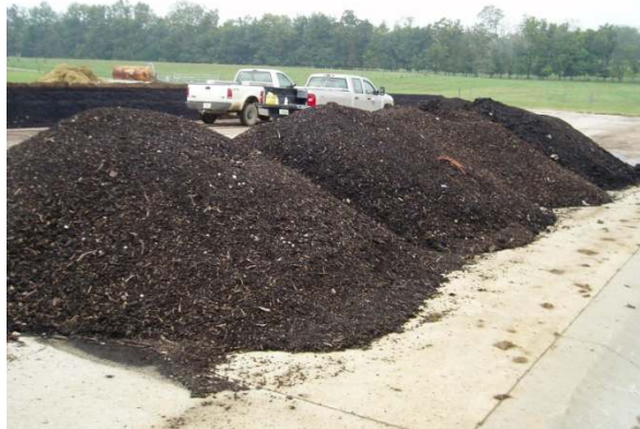
Demonstration area showing fallen animal composting.

During the 2011 fiscal year, new practices were added to the cost share program to better address the needs of producers in Kentucky. Those practices included fallen animal composting and precision agriculture to assist with the Mississippi River Basin Initiative.